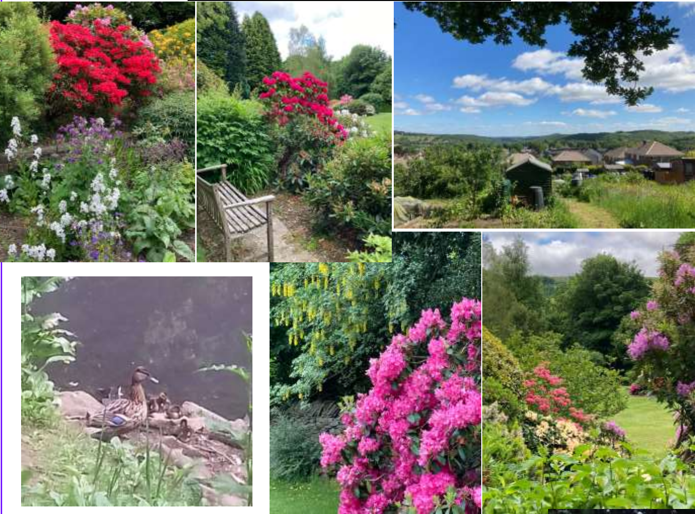
These photos were taken in Jean Burhouse's garden and around Meltham. Meltham certainly is a very colourful town.