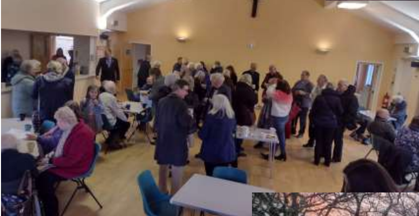
Above: Photos taken from the Churches Together Covenant Service.