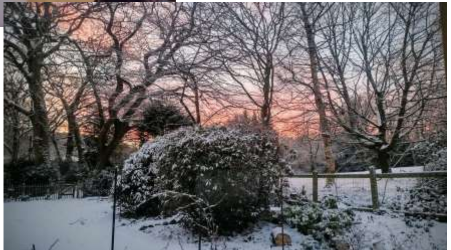
Below: Photos taken from around the Parish