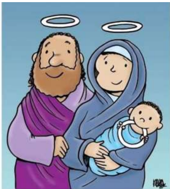
THE BABY JESUS STARTS TEETHING.