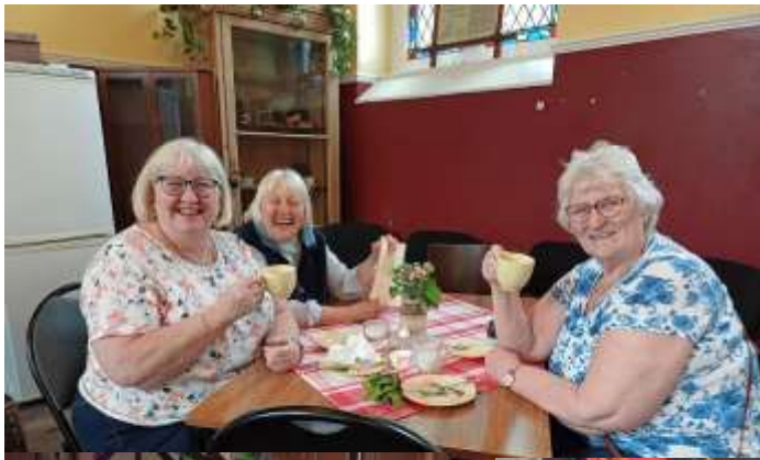
St Mary's Flower Festival