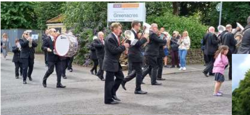
Meltham Memories Retro weekend Parade.